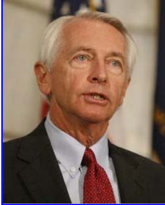
Gov. Steve Beshear